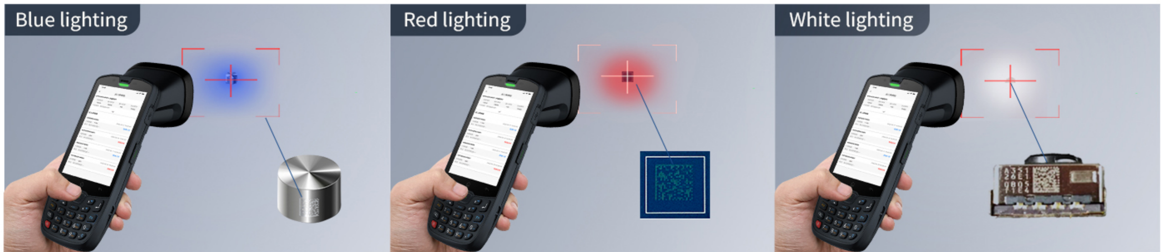
Cross positioning scanning frame, anti-mis-scanning

Automatically adjust the appropriate lighting mode according to the different background colors and materials of the target DPM code being read.